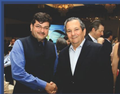
At forbes global CEO conference held in Bali in 2013 with Mr. Ehud Barak Ex. Israeli Prime Minister