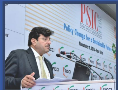
FICCI Convention 2014