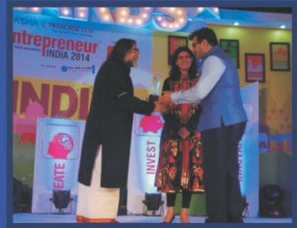
Security Entrepreneur Award - 2014