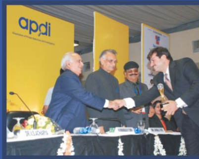
Security Entrepreneur of the Year Award - 2008