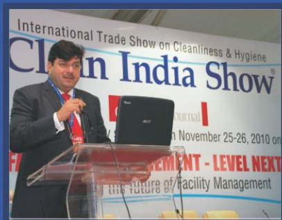
Clean India Convention 2010