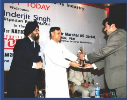
Fastest Growing Manned Guarding Company Award - 2005